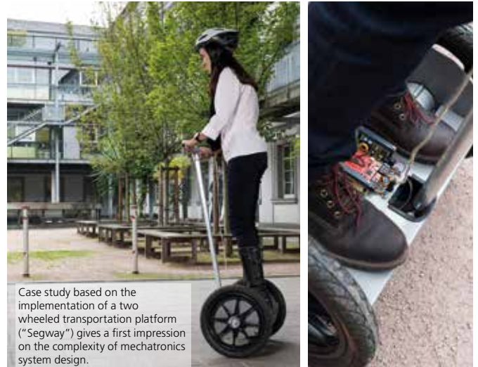
Case study based on the implementation of a two wheeled transportation platform (“Segway”) gives a first impression on the complexity of mechatronics system design.

Finally implementation and integration leads to testing the overall system according to the early requirements. During the overall process of engineering, testing has been prepared and done in order to check the maturity level. Quality assurance has been executed in simulations and prototyping environments. At the end of those phases, the real system can be tested for the first time to finally check the user requirements in a hardware-in-the-loop environment or even in real test scenarios.